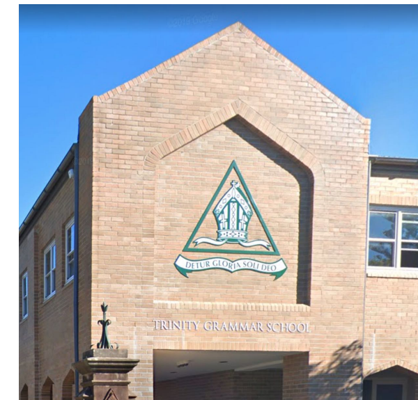
Precedent: Existing pin fixed signage facing Prospect Road