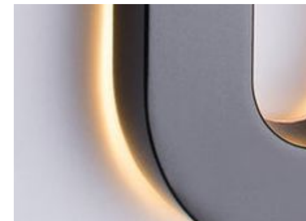
Proposed Signage Lighting Effect