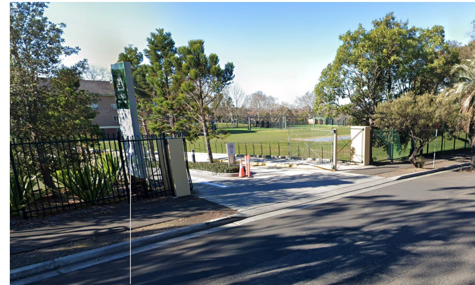
Existing signage wall to be replaced with new design