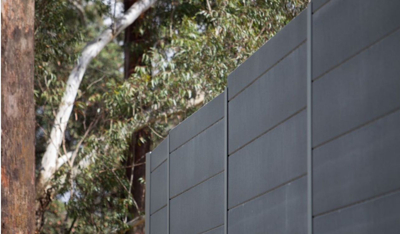
Figure 4 Hebel Wall Noise Barrier at the Cheltenham Services Facility Site