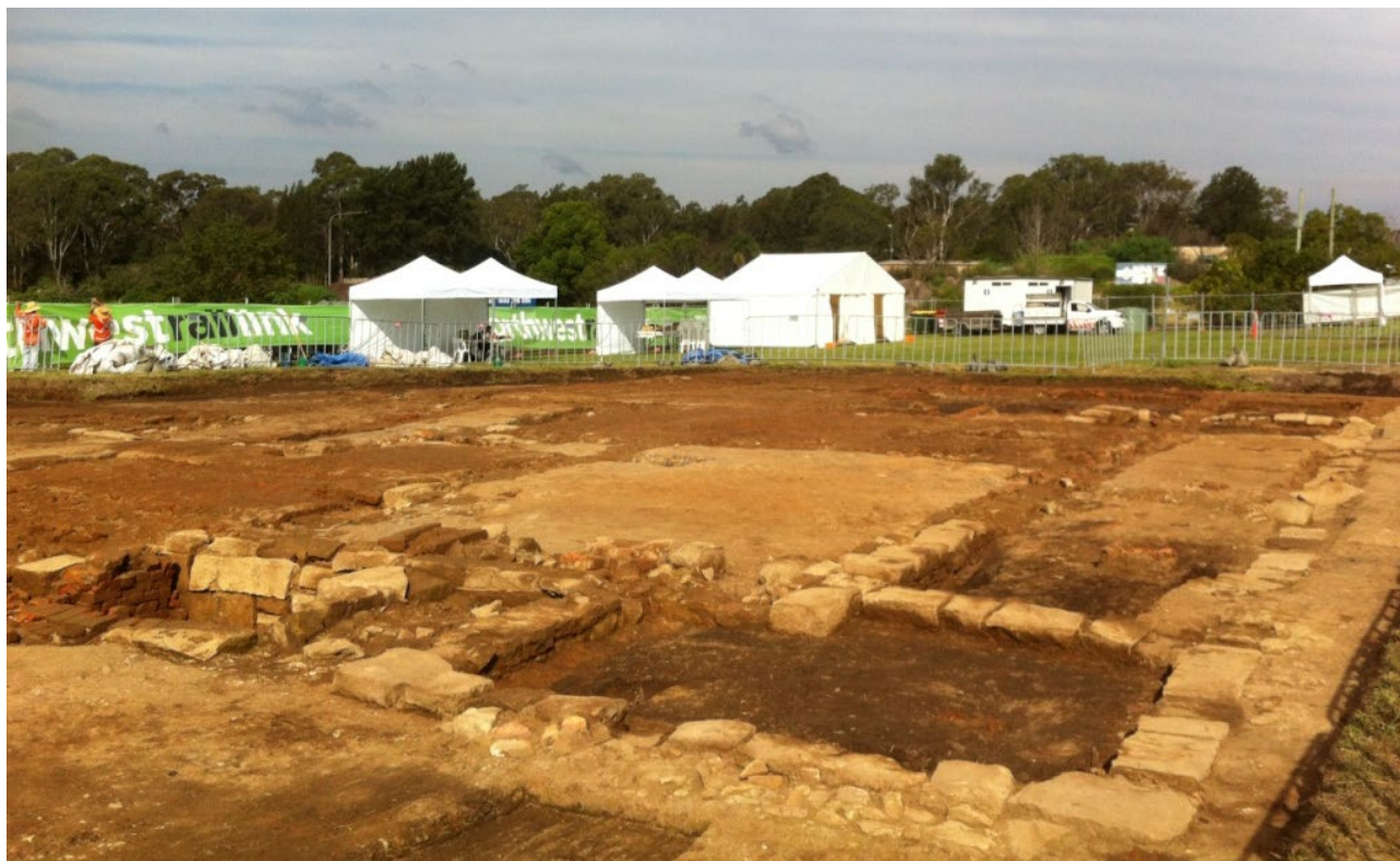
Figure 5 White Hart Inn Excavation Site