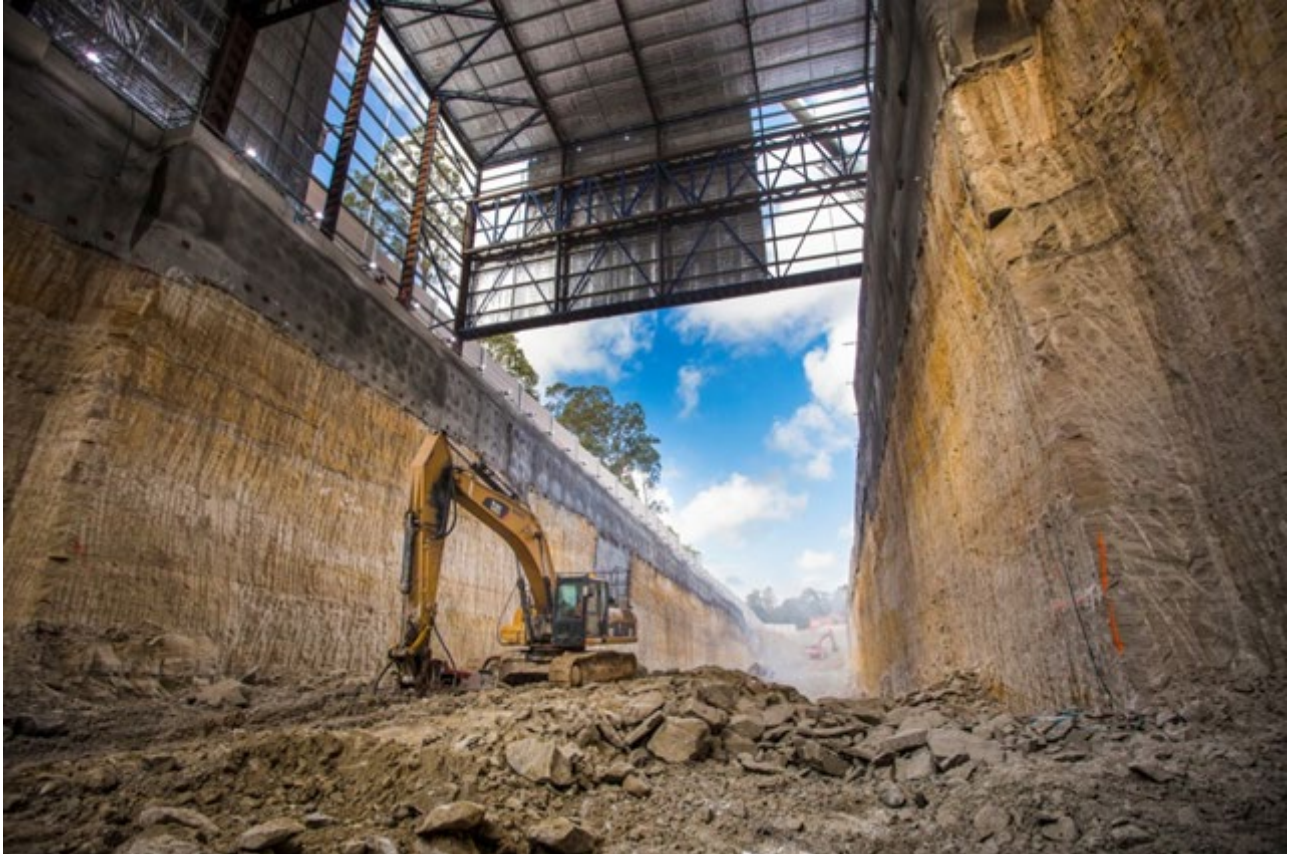
Figure 3 Spoil and Excavation Works at the Showground Site