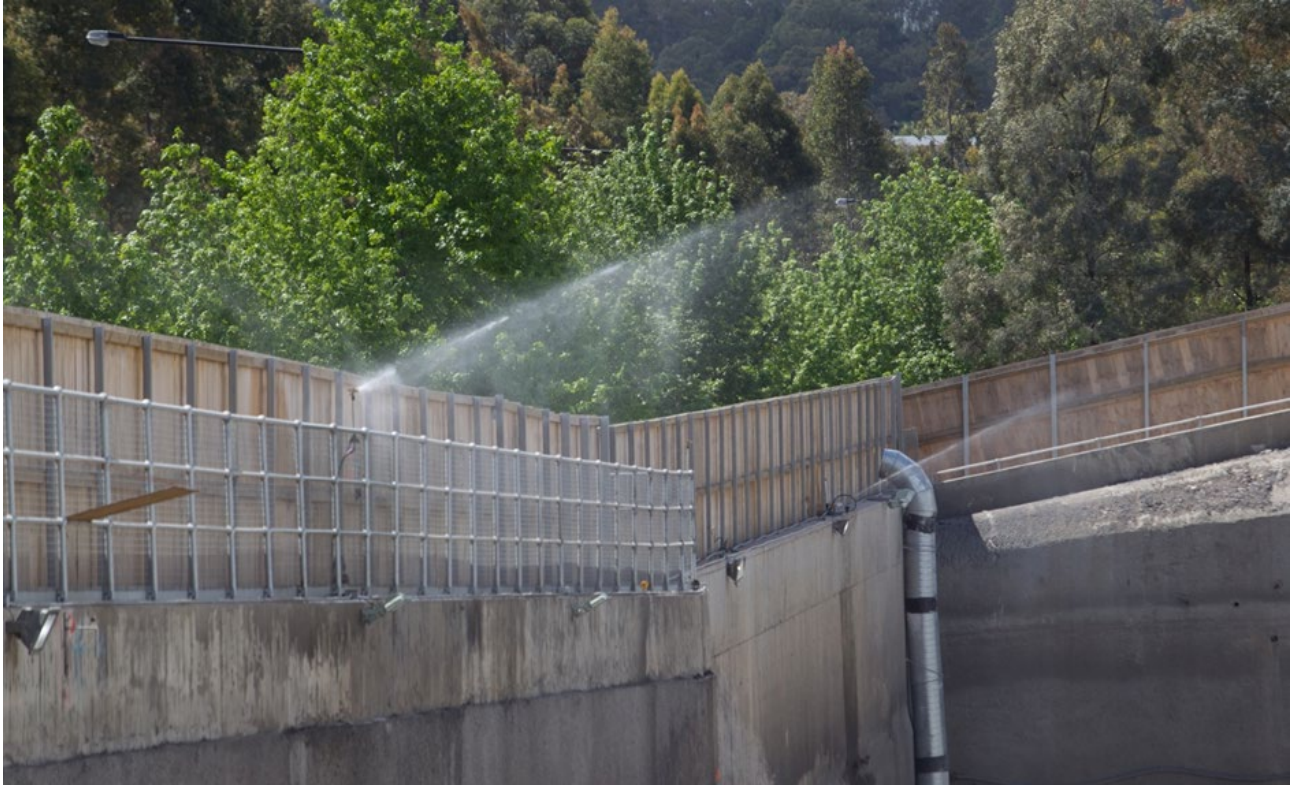
Figure 8 Dust Mitigation at Northwest Station Site