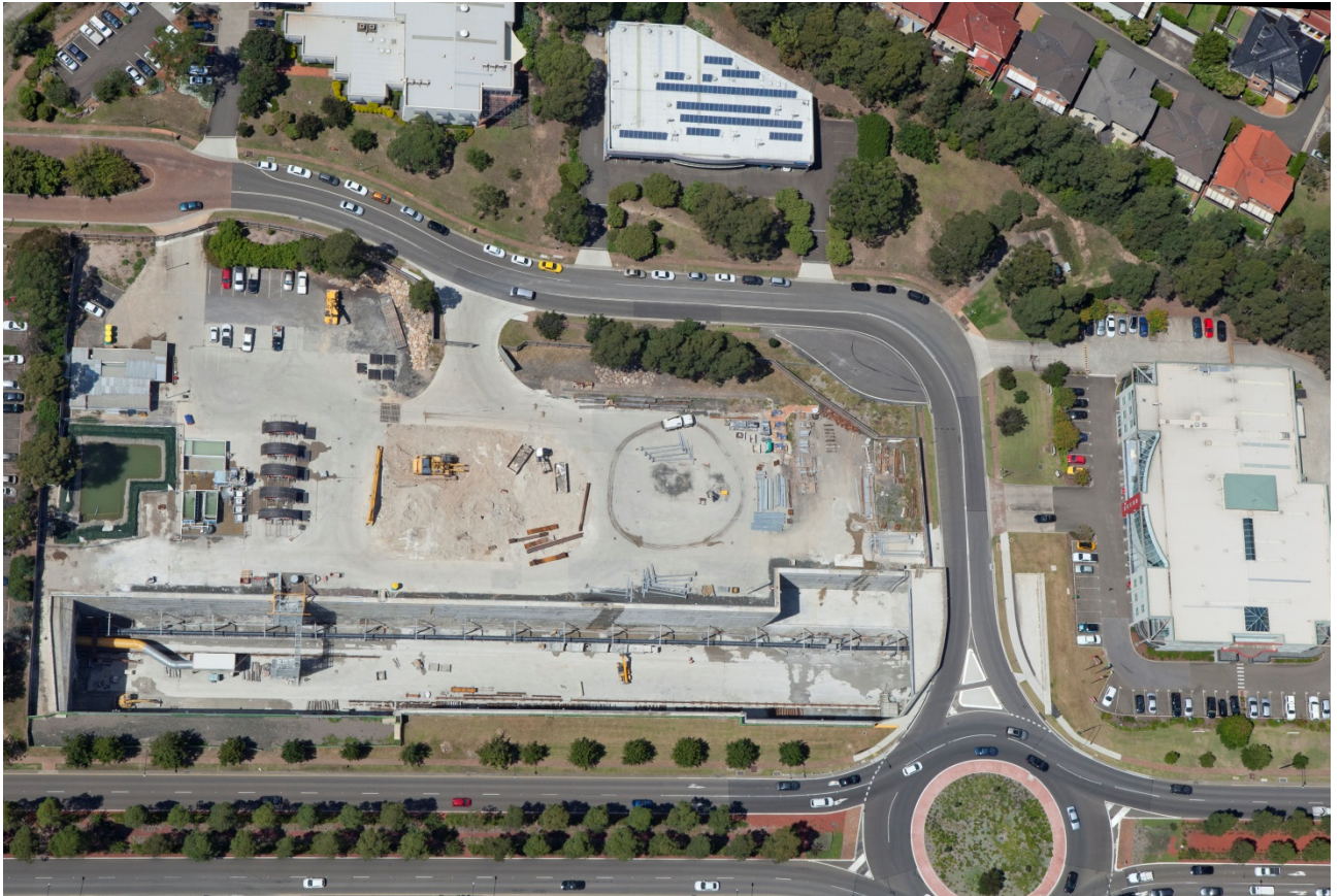
Figure 2 Aerial View of the Sydney Metro Northwest Station Site