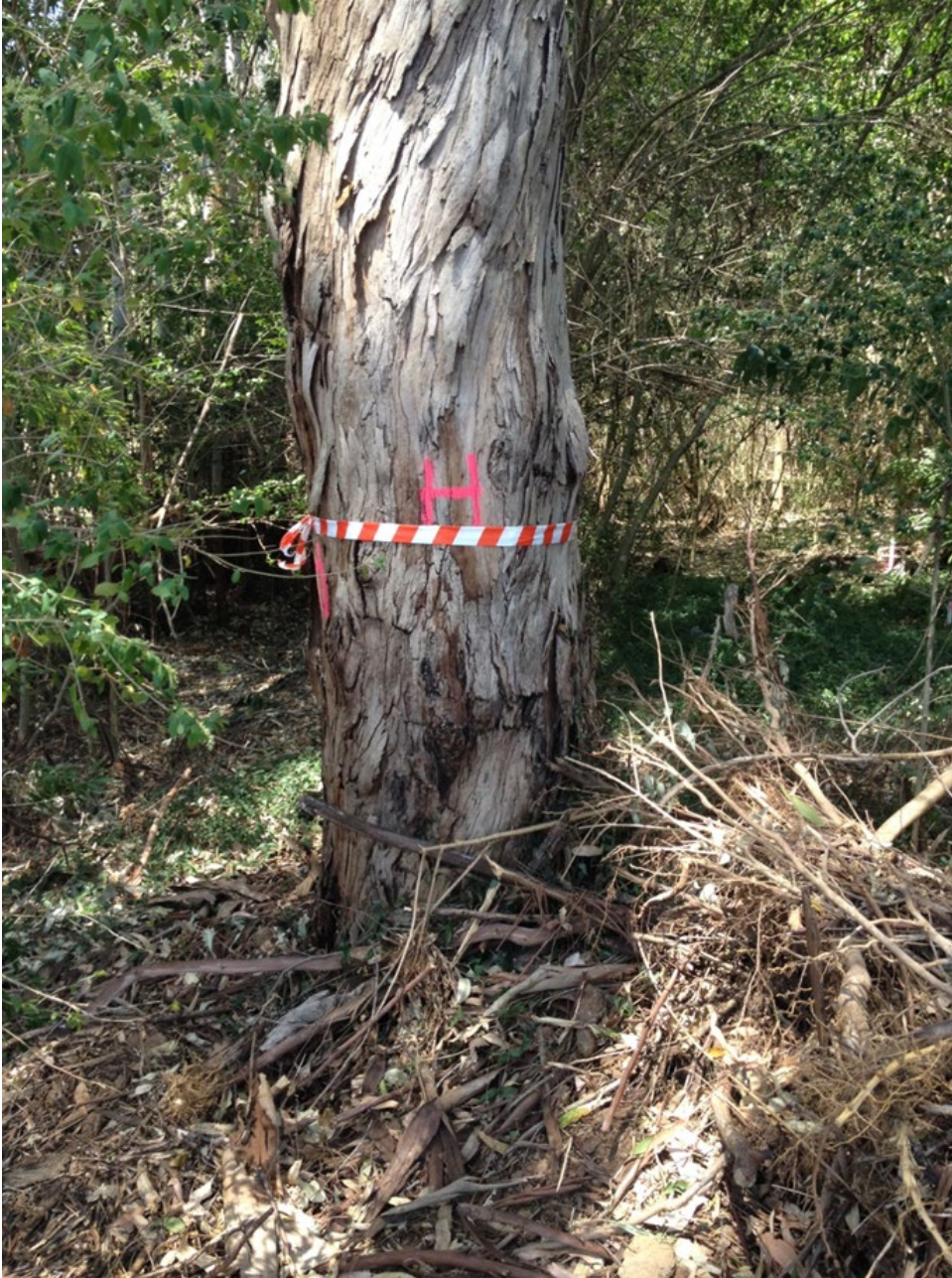
Figure 6 Demarcation of Retained Flora