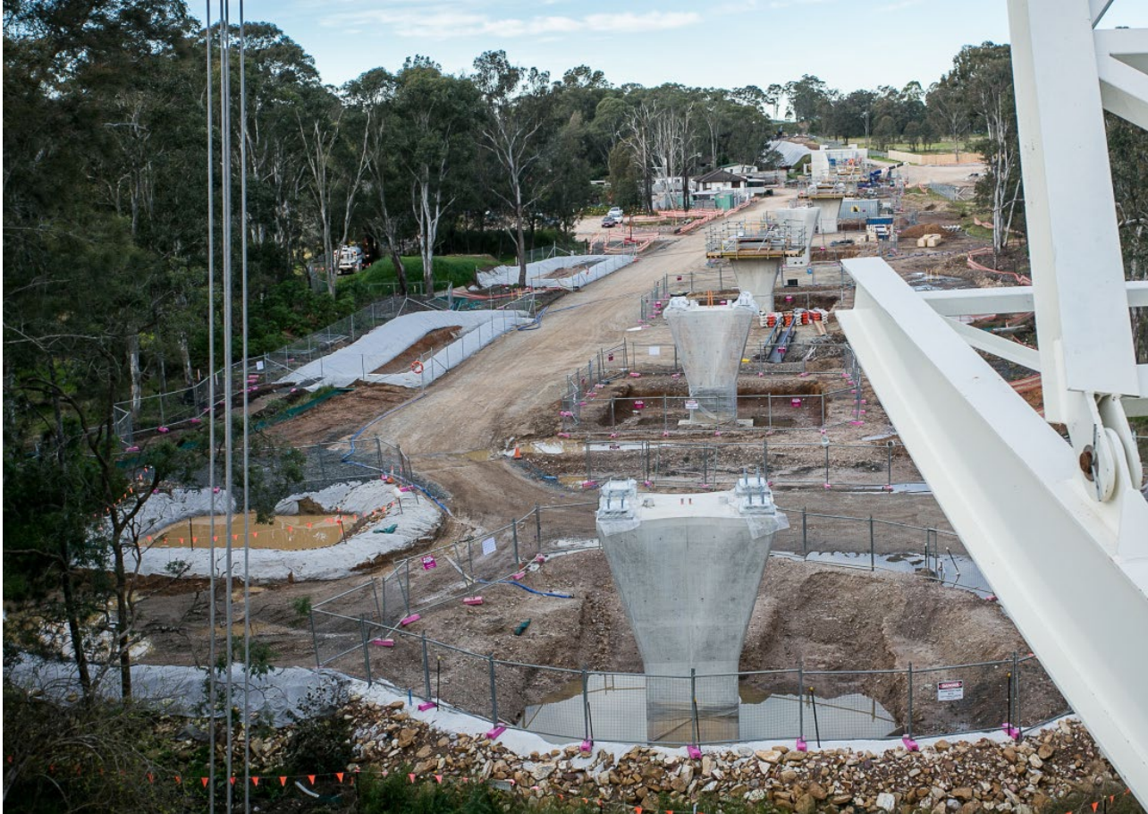
Figure 7 Erosion and Sediment Controls at the Cudgegong Road Site