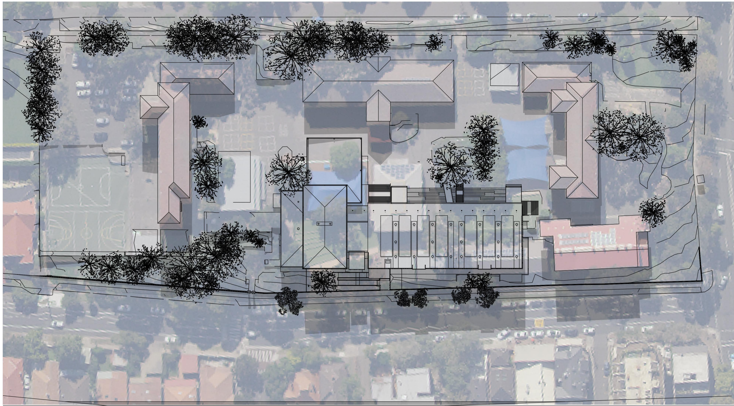
1 PLAN 21st June 1pm