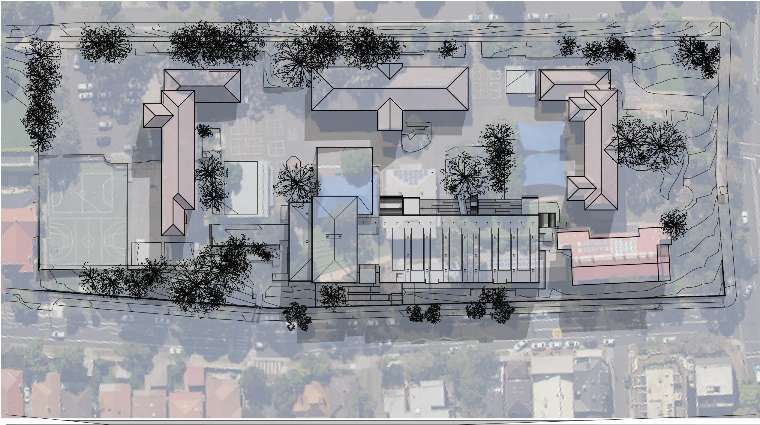
4 PLAN 21st June 12pm