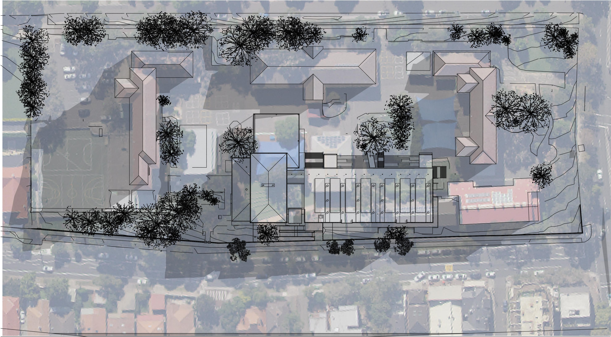
1 PLAN 21st June 9am