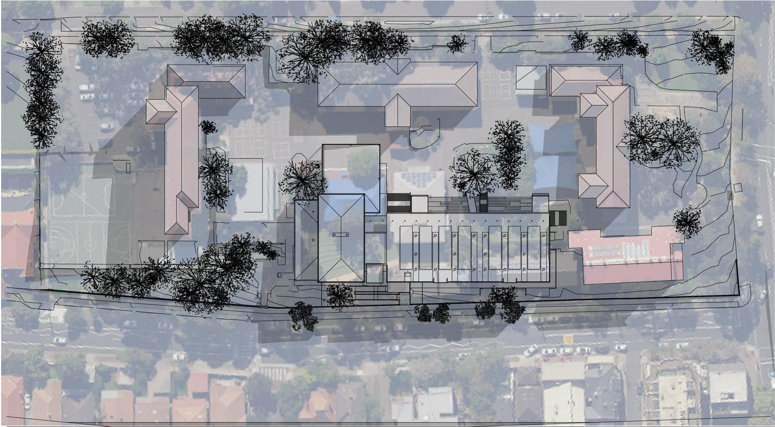
2 PLAN 21st June 10am