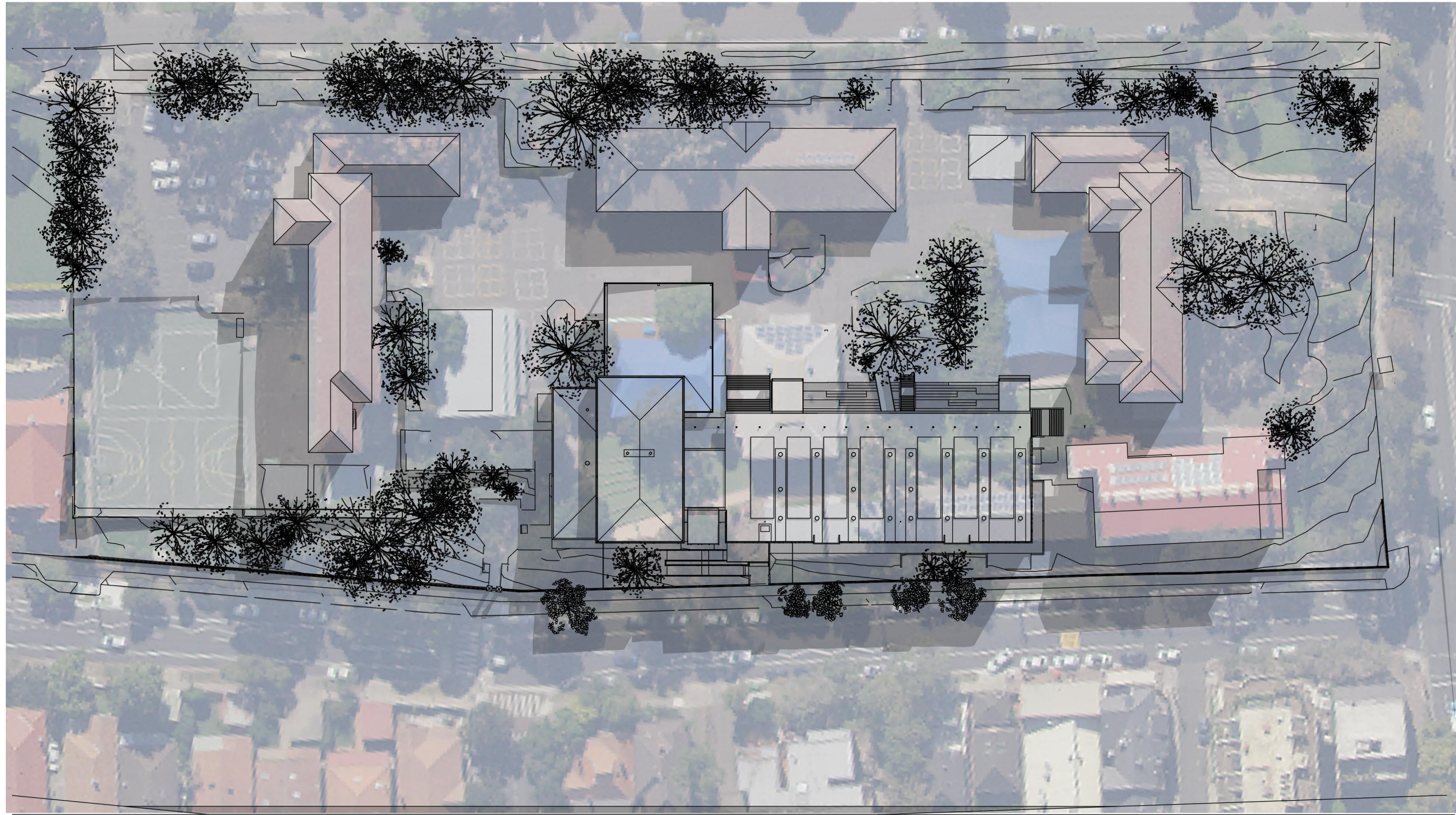
3 PLAN 21st June 11am