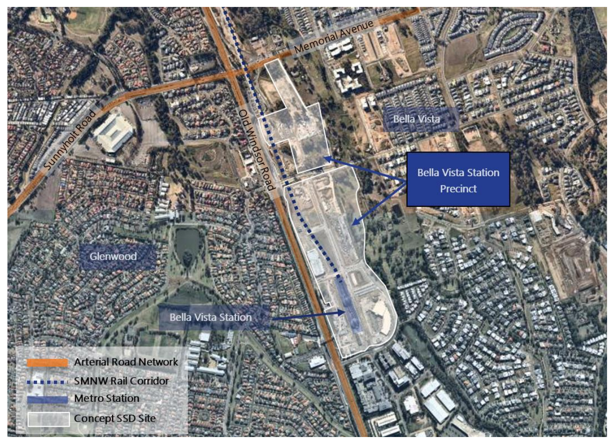
Figure 1: Bella Vista Station Precinct Location