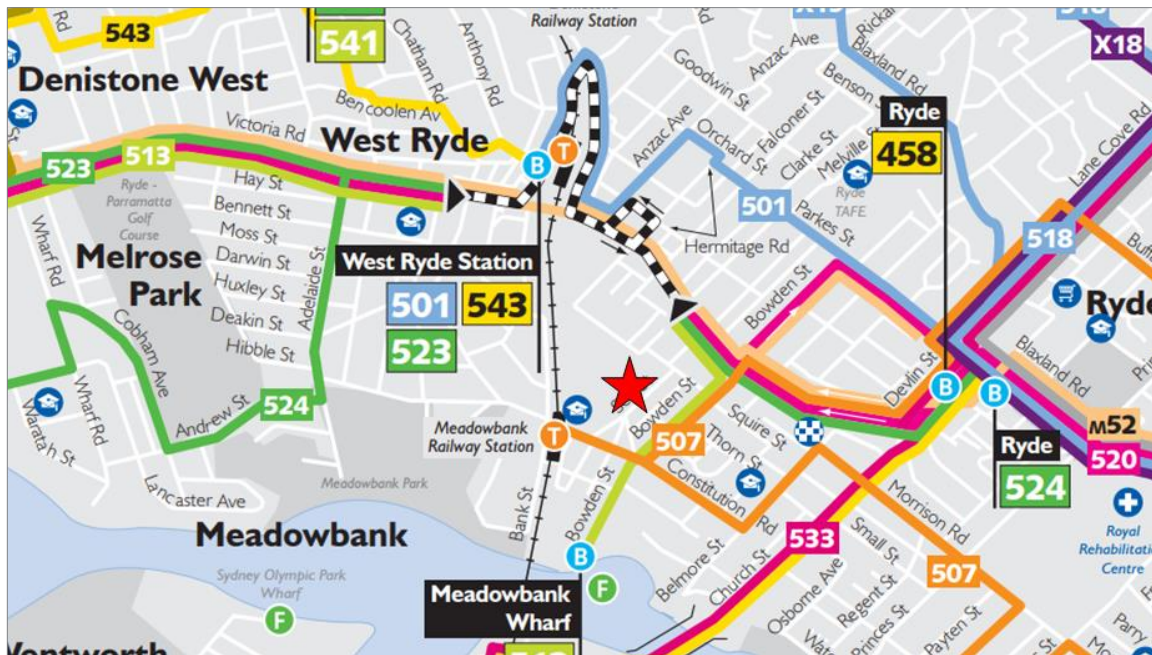
Figure 3.2: Surrounding bus network