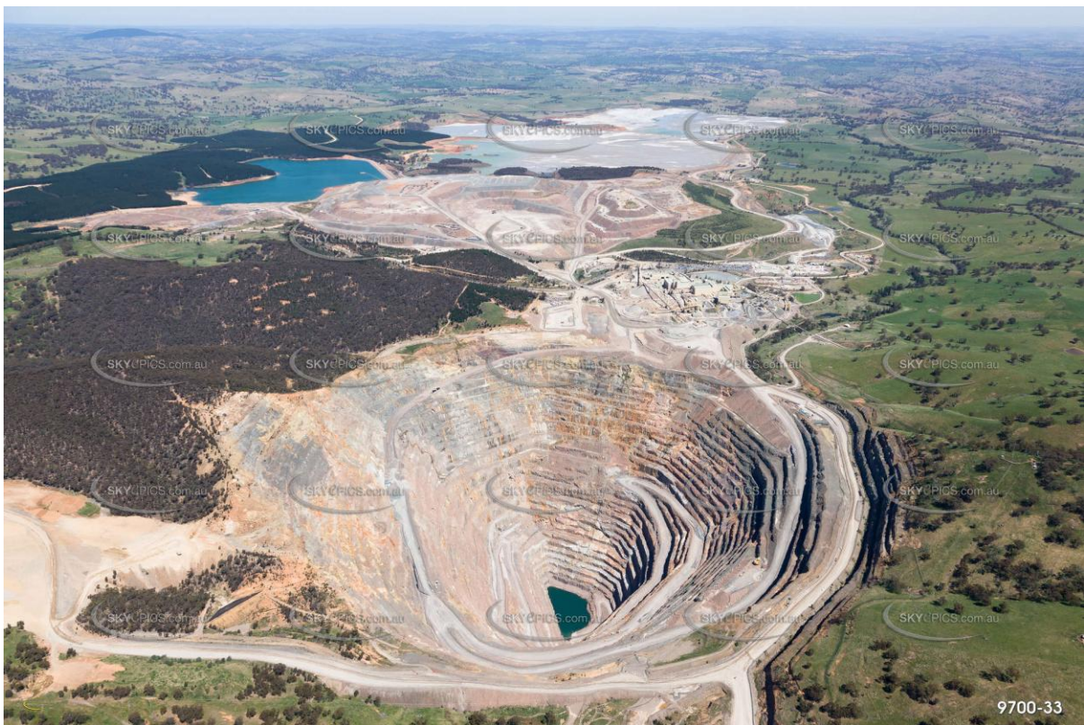
Figure 1 – Overhead view of Cadia Valley Operations, NSW