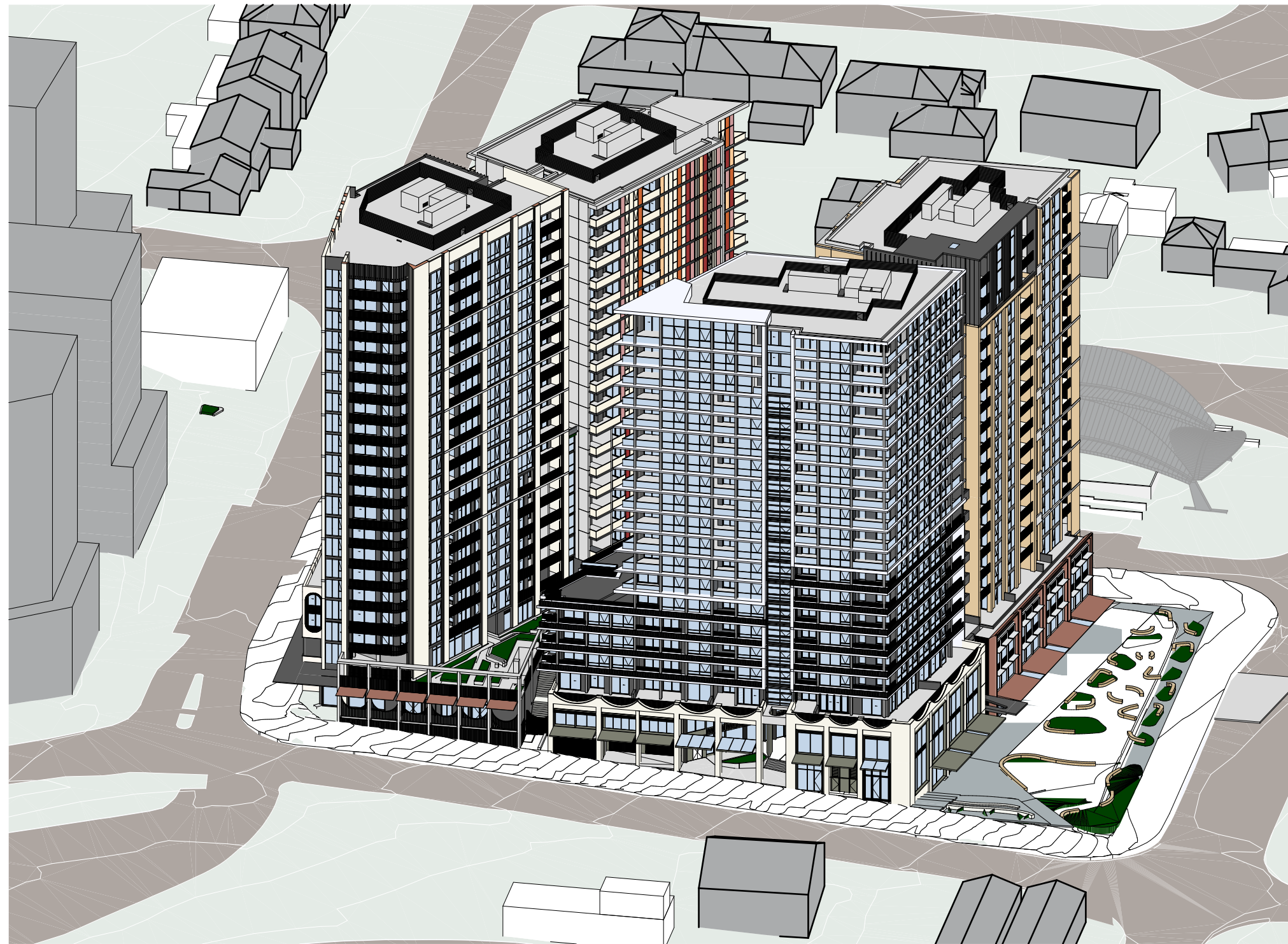
JUN 21st - 2:00pm