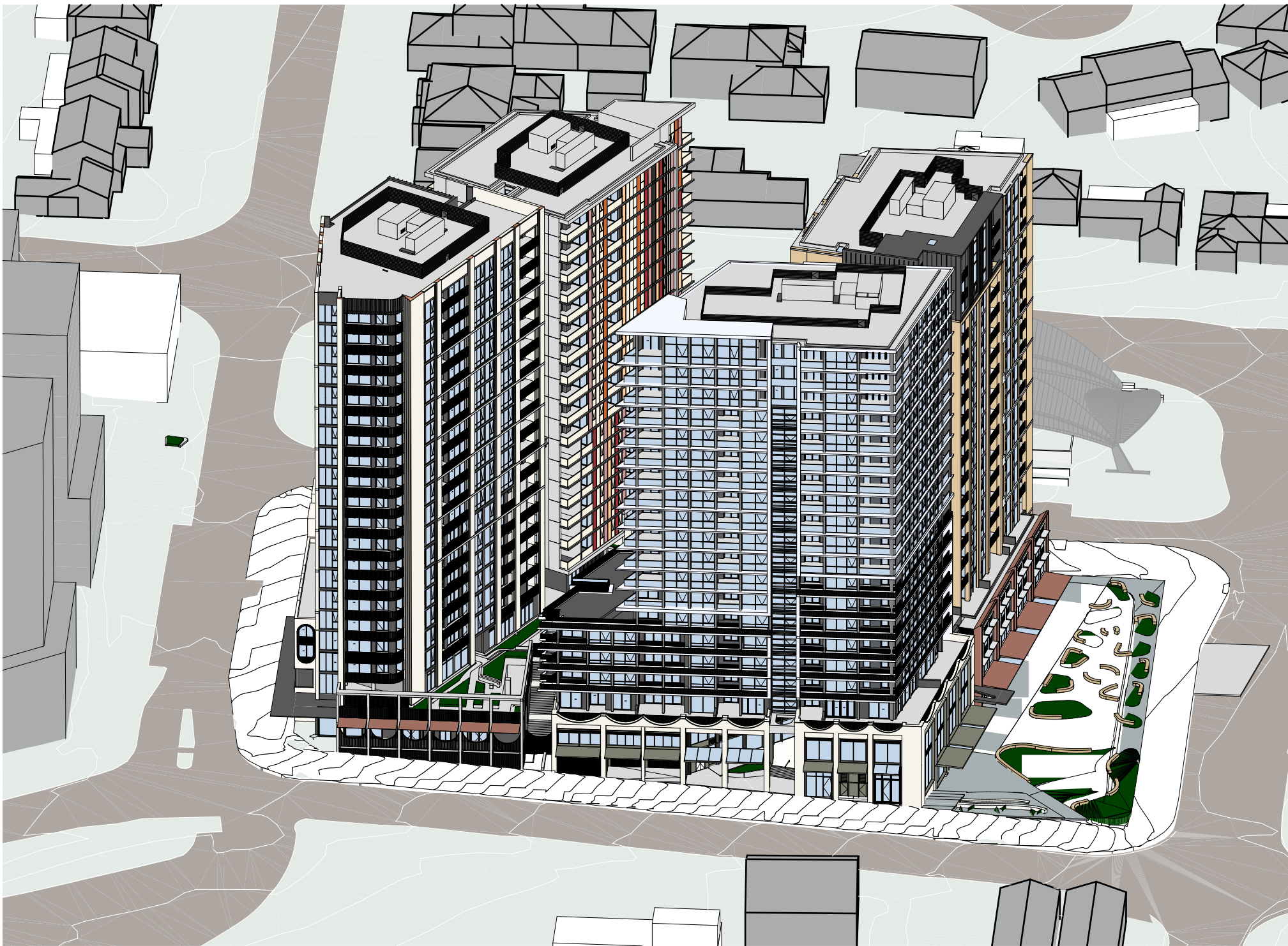
JUN 21st - 1:30pm