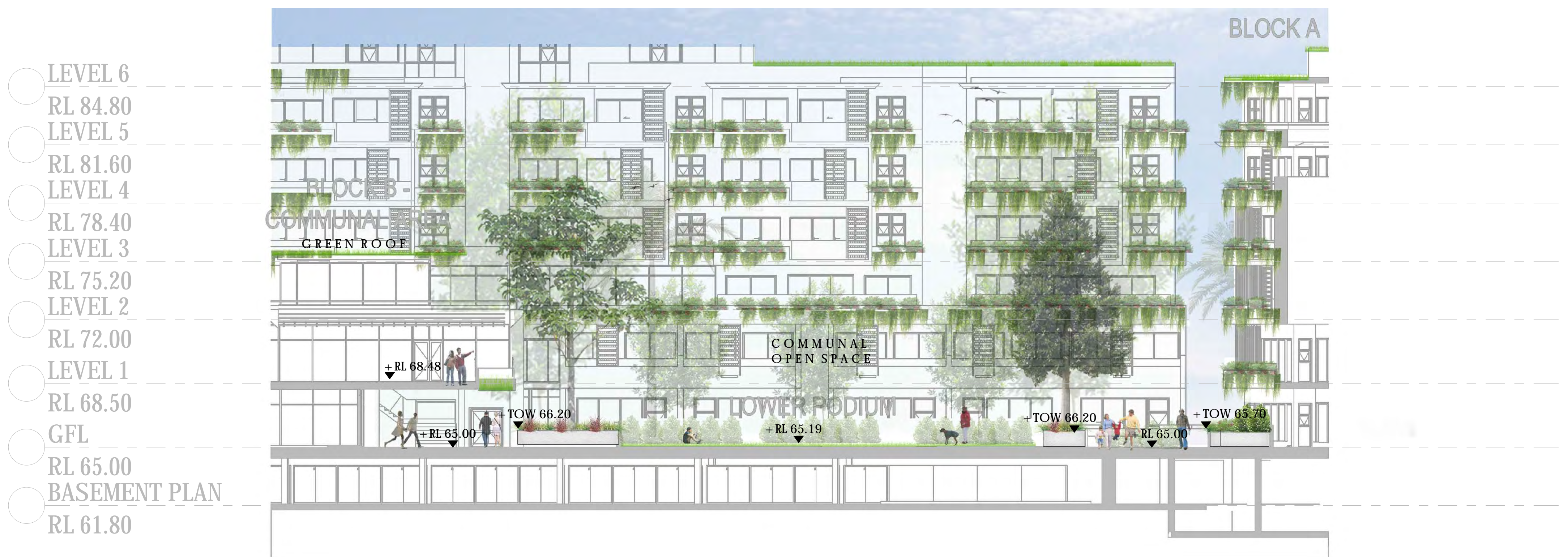
SECTION BB SCALE 1:300 @A3