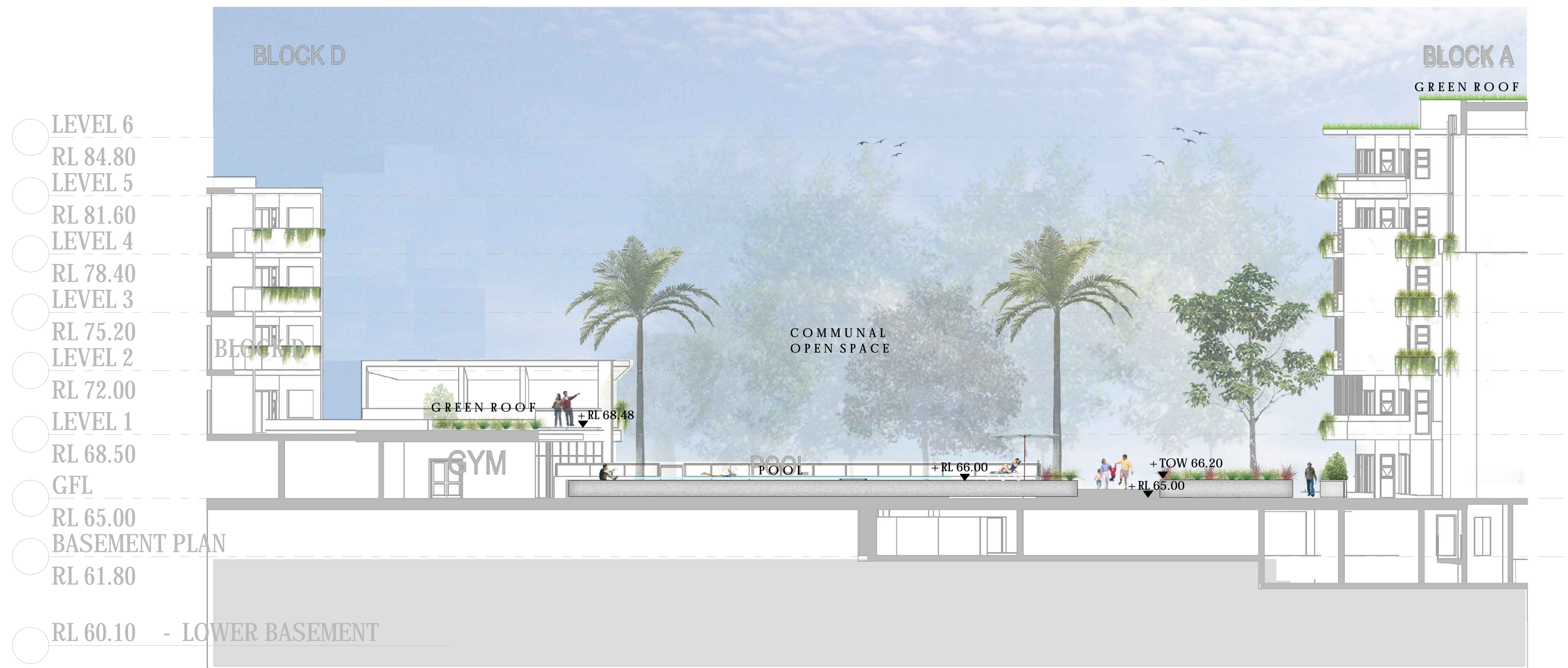
SECTION AA SCALE 1:300 @A3