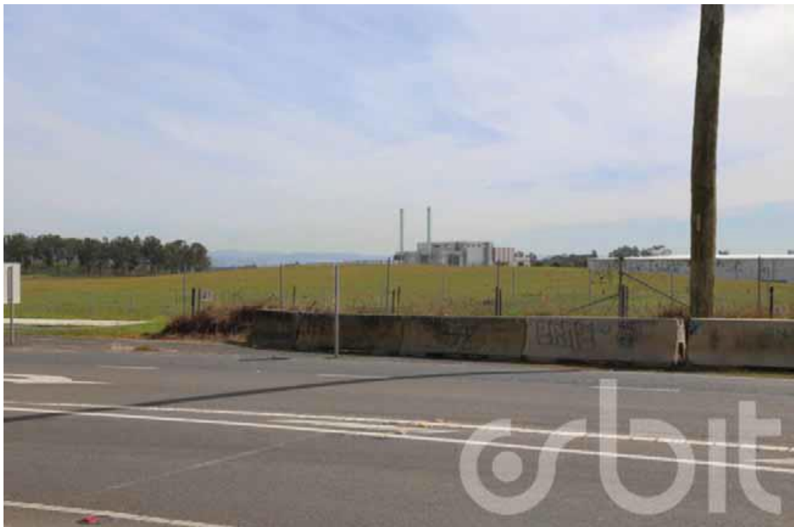
Figure 1 – View of the facility from viewpoint 7 – Old Wallgrove Road, south-east of the site Visual Impact Assessment

Given the heavy industry nature of the proposed energy-from-waste facility and its bulk and scale as viewed from the south, in comparison to the pre-existing nature of development within the Eastern Creek Business Park, it is requested that the proponent provide extensive planting along the southern boundary (i.e. south of the bio-retention basin). Extensive boundary planting on the southern boundary would be appropriate to screen the energy-from-waste facility from the Eastern Creek Business Park, as well as from further afield in the Western Sydney Employment Area.