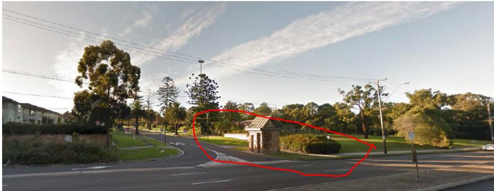
Plate 2.5 View of the Site from Joseph Street

The entrance to Botanica Estate is clearly articulated by a sandstone feature wall that is lit at night.