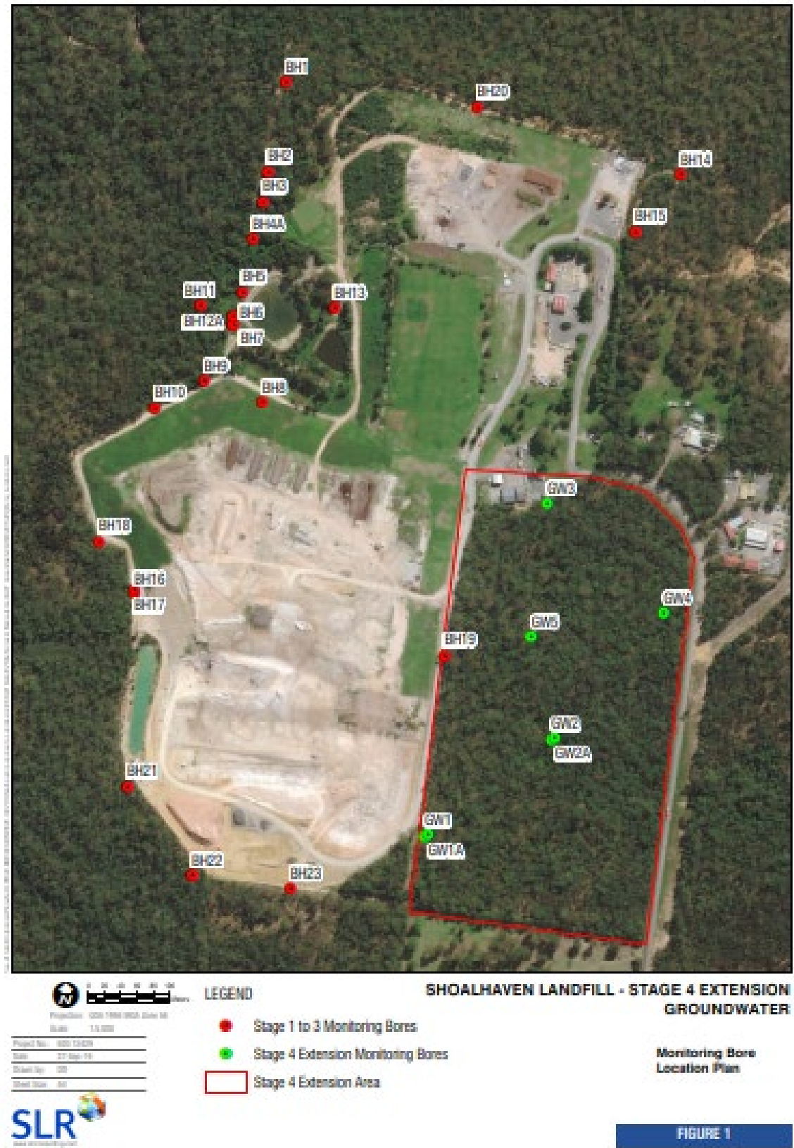
Figure 1 Monitoring Bore Location Plan