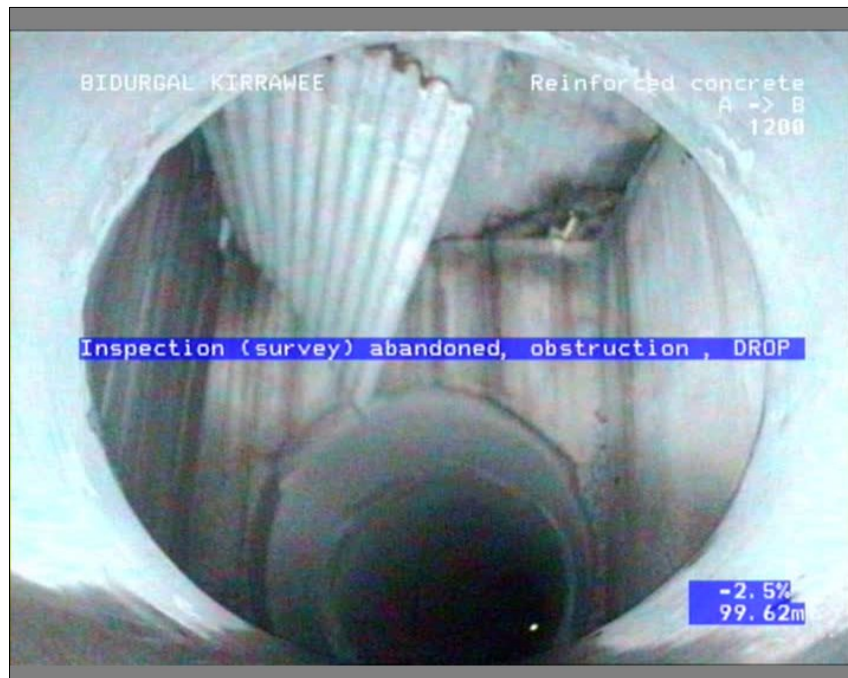
Photo: 1_1_7_A.JPG, Media No.: 20A BIDU_0, 00:08:08 99.66m, Inspection (survey) abandoned, obstruction , DROP / DROP