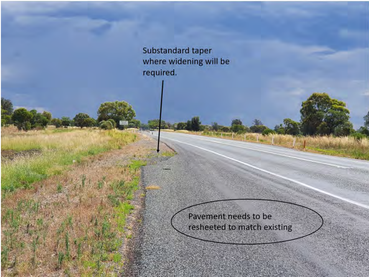
Photograph D.3 Existing BAR (looking south)