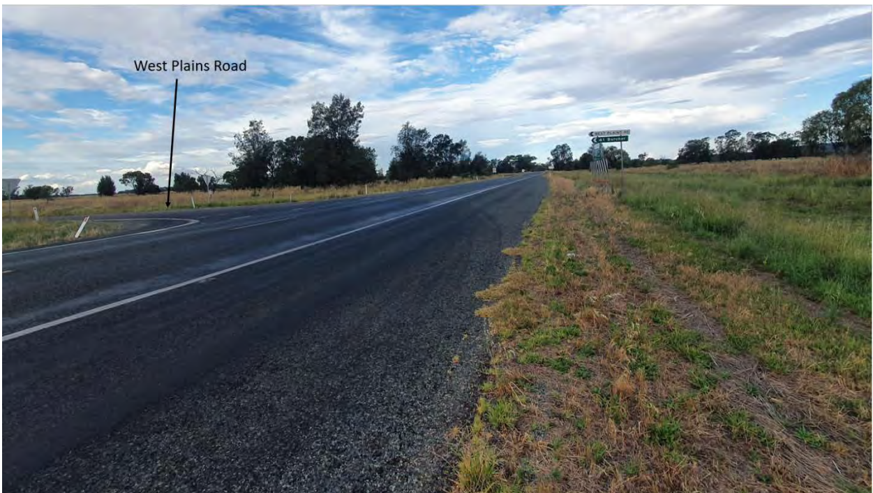
Photograph D.4 View of West Plans Road and straight sight distance to the north (looking north)