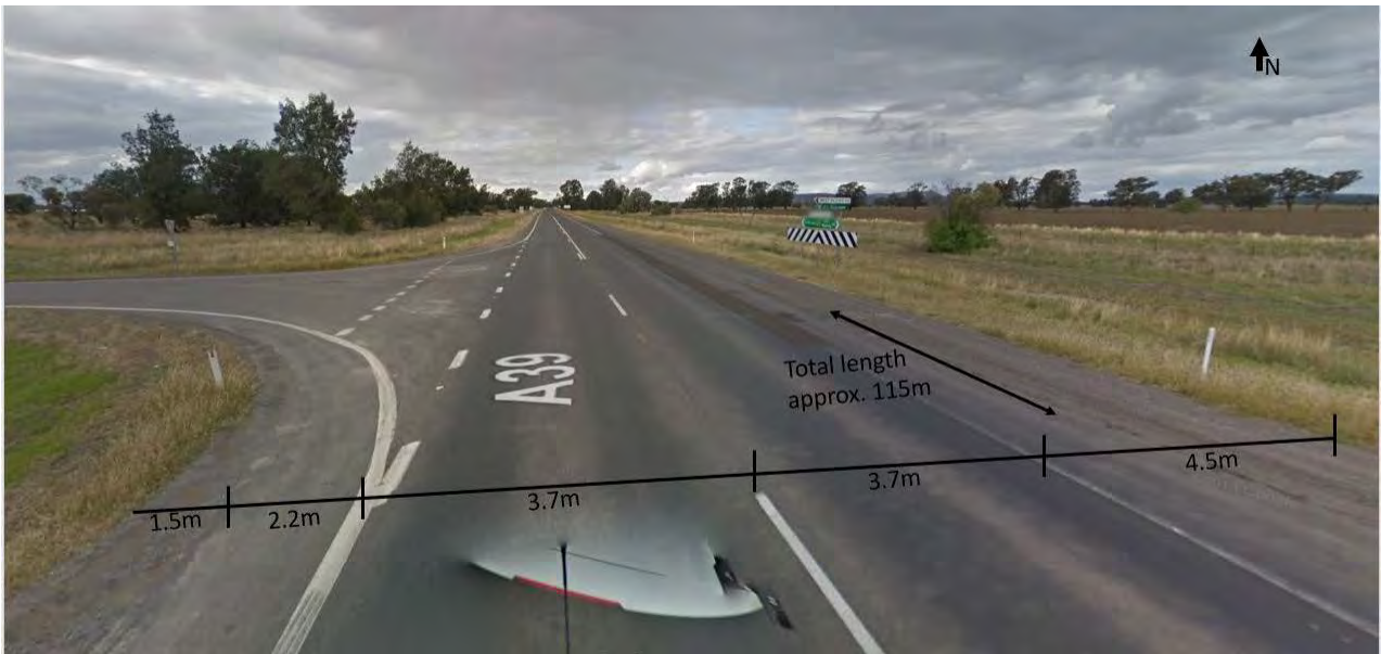
Photograph D.1 Intersection dimension (looking north)