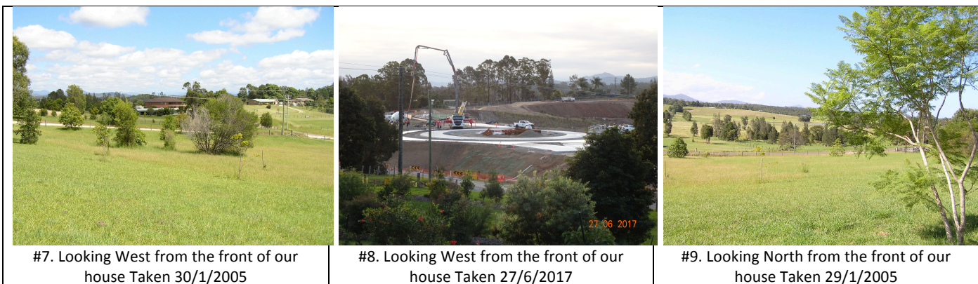
Photo #4 and #5 are essentially the same view shifted 12 years in time. Photo #7 and #8 are essentially the same view shifted 12 years in time.