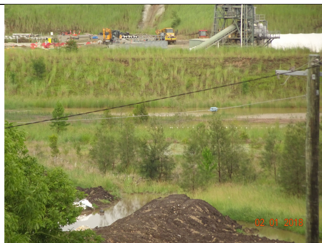
Looking North from our house taken 2/1/18

During the 3 years construction of the highway it has been relatively dry with only very minor flooding in this area. The small amount of rainfall we have had in recent months has left erosion problems around the Letitia Close/Old Coast Road intersection and roundabout that the RMS and Pacifico have been made aware of but failed to deal with yet. We believe they are expecting the hospital road to “fix” these issues.