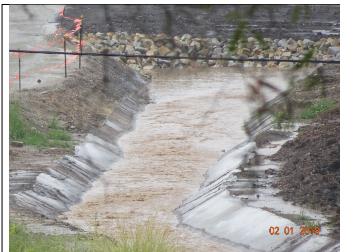
Looking North from our house taken 2/1/18