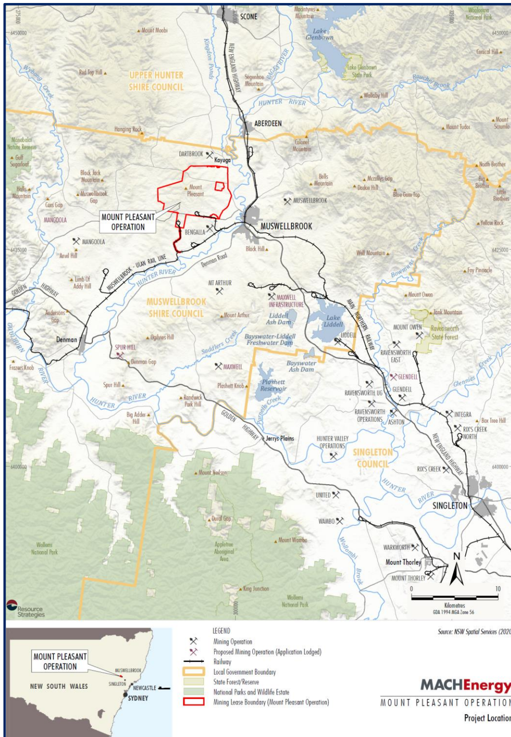
Figure 1 | Regional context map

The Mount Pleasant Operation is an open cut coal mine, located approximately 3 kilometres (km) north-west of Muswellbrook in the Upper Hunter Valley of New South Wales (NSW) ( Figure 1 ). MACH Mount Pleasant Operations Pty Limited (MACH) owns and operates the Mount Pleasant Coal Mine.