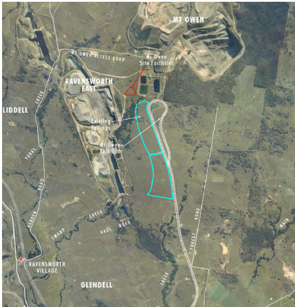
Figure 2: Photo Showing the Mount Owen and Ravensworth East Mines & the Existing and Proposed Tailings Dams.

It is proposed to operate the facility 7 days per week and 24 hours per day. The initial maximum throughput of Ravensworth East coal via this facility is envisaged to be 1.5 to 2 Mtpa.