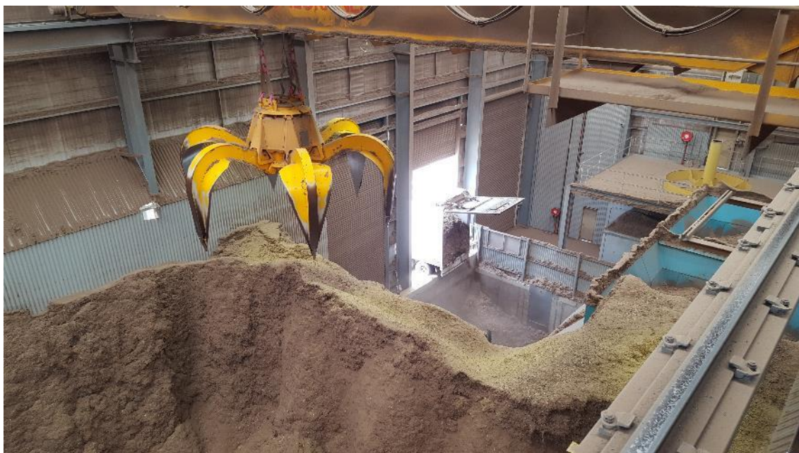
Plate 4 – Material Grab used to load conveyor system

A purpose built grab is used to pick up the material to deliver onto the feed conveyor. Some dust is generated during this process however the grab has a lockout which prevents it working while the receival doors are open. This ensures that internal dust generated does not leave the building.