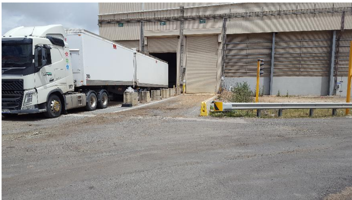
Plate 2 – Truck Reveal