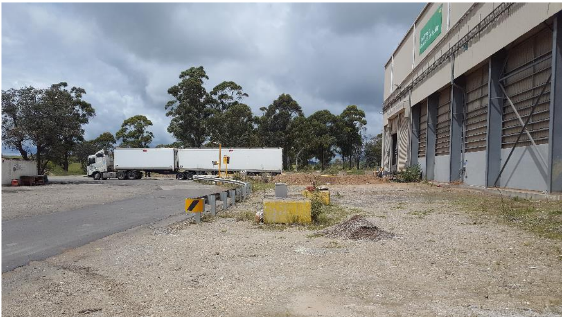
Plate 1 – NSF Truck Reversing into Receival Shed

The material is delivered by truck which reverses into the shed. NSF is then shaken into the receival bunker which is then “grabbed” by an overhead crane which can either reclaim the material into the main storage bunker or into the conveyor hopper. The material is weighed on the conveyor to control fuel dosage to the kiln. Data transferred to the control room includes conveyor speed and material weight which can be adjusted as required based on operating data from the kiln.