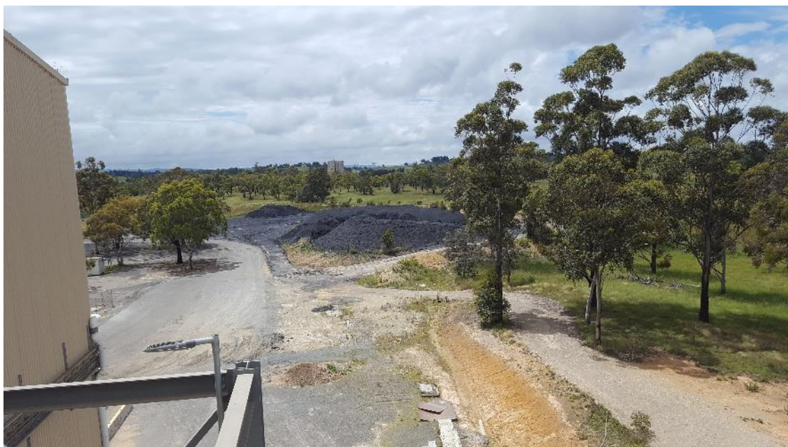
Plate 6 – Elevated View of area around receival shed

The inspection covered all sides of the receival shed and there was no visible dust leaving the facility. There were no signs of NSF spillage outside of the shed including the feed conveyor area, truck access areas, hardstand or surrounding landscaping.