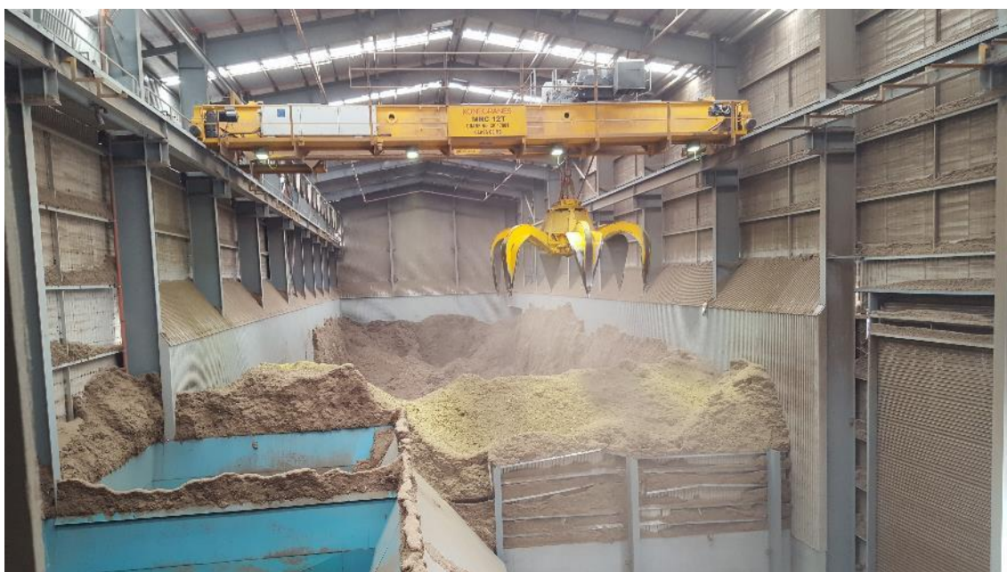
Plate 5 - Material Grab used to load conveyor system

A purpose built grab is used to pick up the material to deliver onto the feed conveyor. Some dust is generated during this process however the grab has a lockout which prevents it working while the receival doors are open. This ensures that internal dust generated does not leave the building.