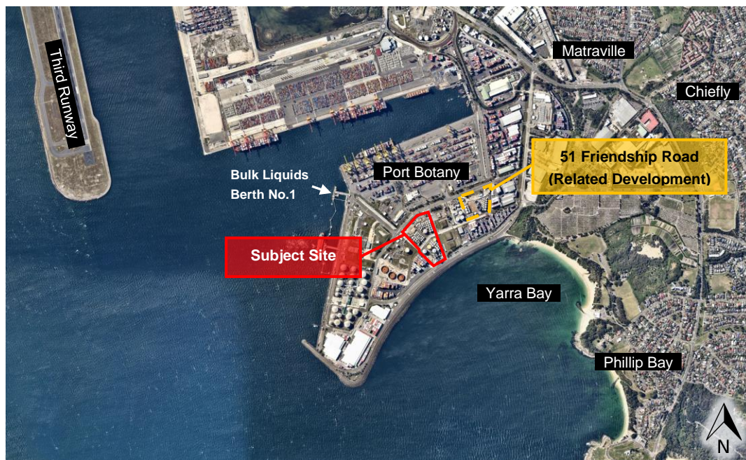
Figure 1 | Site and immediate surrounds

complying development certificates (CDCs). The Applicant is also the holder of Environment Protection Licence (EPL) No. 1048 which authorises the carrying out of activities at 45 Friendship Road and 51 Friendship Road.