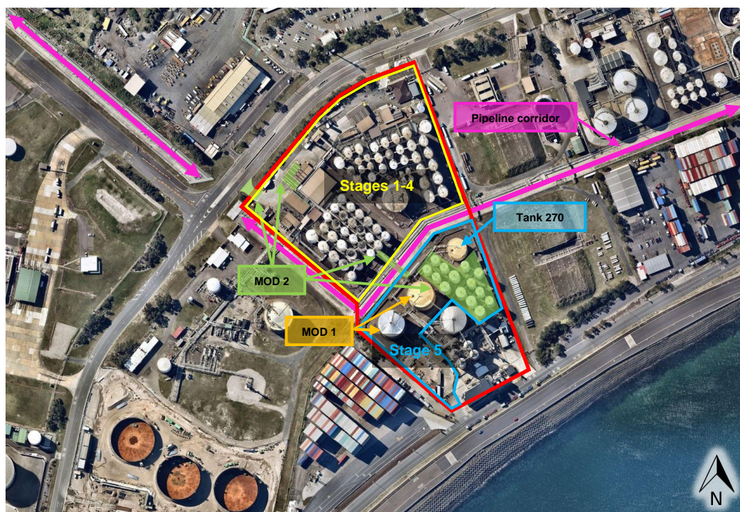
Figure 2 | Overview of the subject site (45 Friendship Road)